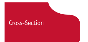
Queen Anne SATE-70