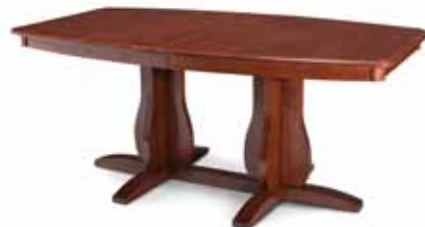
Shown with: Boat Top, Hartford Pedestal