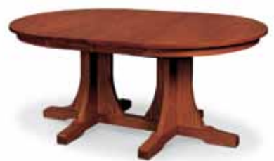
Shown with: Oval, Prairie Mission Pedestal