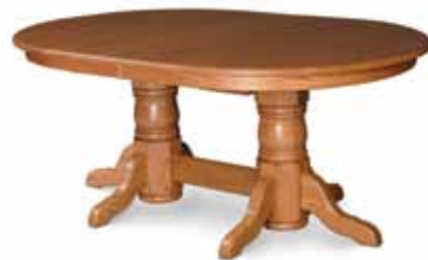
Shown with: Oval, Traditional

Build your own double pedestal table to order. The double pedestal table offers one of the most unique looks available for the dining room or kitchen. Using the examples shown here for inspiration, begin creating your own double pedestal table design.