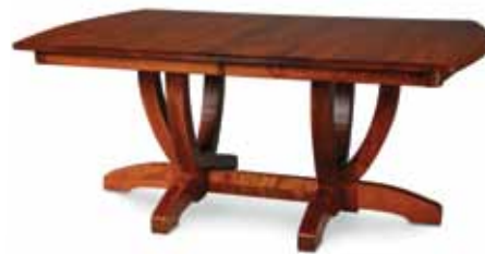
Shown with: Empire, Brookfield Pedestal