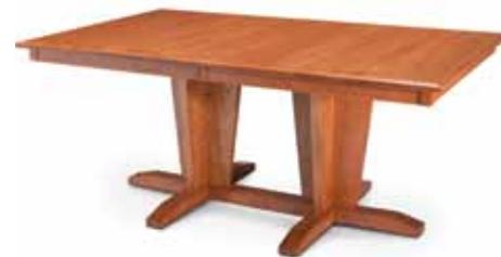
Shown with: Rectangle w/ no Corner Radius, Brooklyn Pedestal