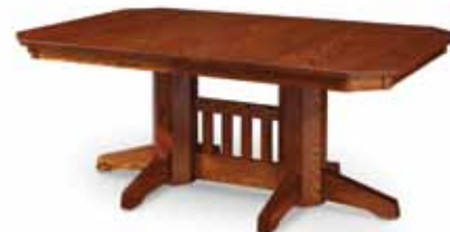
Shown with: Clipped Corner, Prairie Slats Pedestal