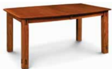
Shown with: Boat Top, McCoy Leg