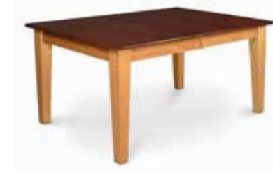
Shown with: 1" Radius Corner Top, Square Tapered Leg, Two tone