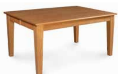
Shown with: 1" Radius Corner Top, Square Tapered Leg