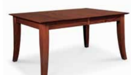
Shown with: Square Corner Top, Loft Leg